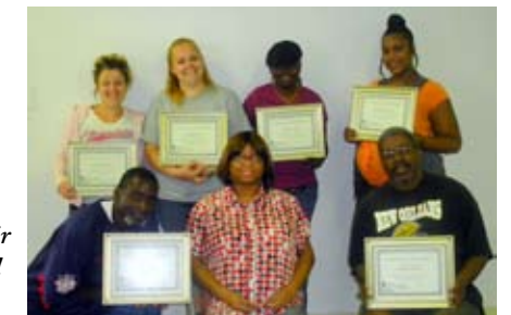
Our latest MoneyWi$e graduates show off their hard-earned diplomas!