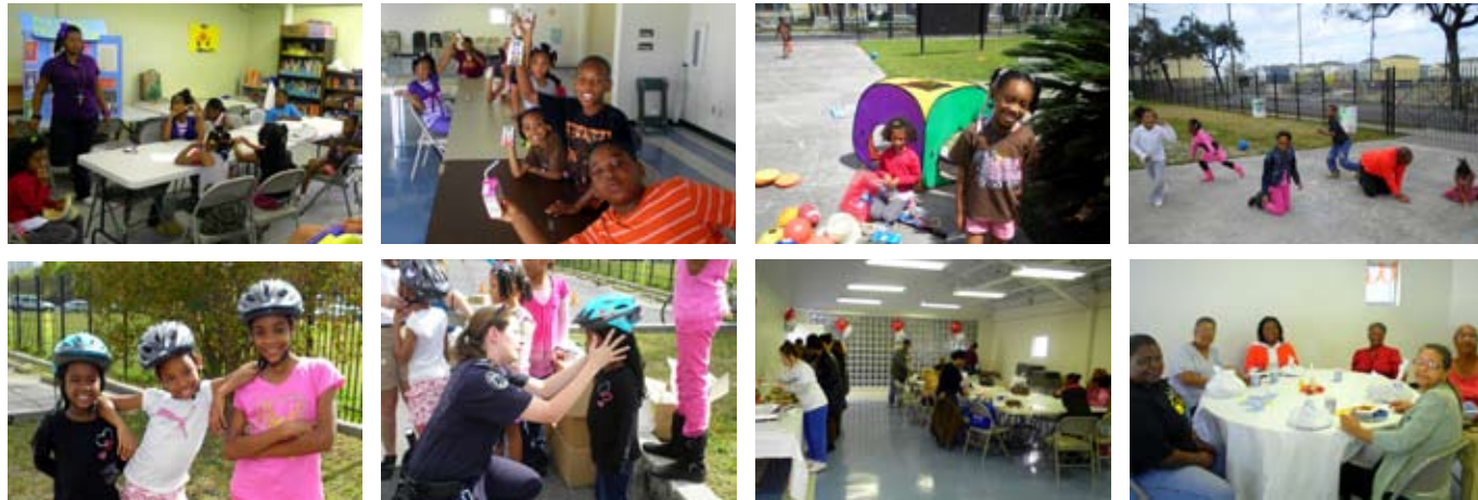
Clockwise from top left: Truth Youth discusses bullying; juice boxes & smiles; Truth Youth playtime; young artists in training; Senior Citizen Day activities; December MoneyWi$e graduation party; "Walk-N-Roll" helmet giveaway; striking a "safety first" pose in their new helmets.

More photos from Sojourner Truth (continued from previous page)